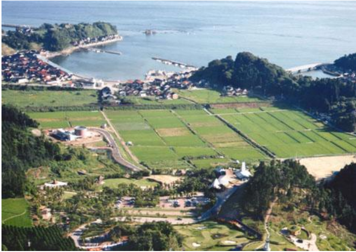
2C: View from hill-side