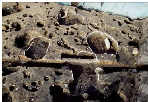
4C: Human bones and related tombs.