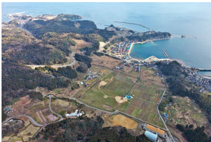
2A: View from North

Figure 2.3) is located on a marine terrace of the Last Interglacial (Koike and Machida, 2001) and has three pit dwelling dugouts with several kinds of early Jomon pottery remains. This site is about 400 m to the east, and is located on the shore of an inlet of Mawaki Bay. These two sites may have had close and strong relationships in this region in the past. Mawaki must have been a very significant region for human occupation during the Jomon period.