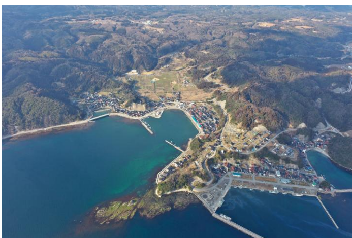
2B: View from South