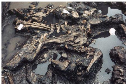
4A: The length of the dolphin skull near the center of the photograph is ca. 40 cm.