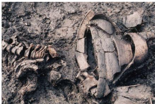
4B: Dolphin bones and Jomon pottery from the Mawaki archaeological site. The diameter of the pottery is ca. 30 cm.