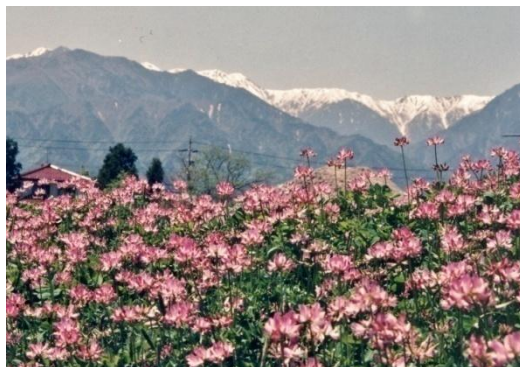
Fig. 12.3 Rice field is covered with Chinese milk vetch, rengeso .

Rengeso ( Astragalus sinicus ) has been cultivated in rice fields in China and Japan as a green manure since the plant produces ammonia from atmospheric nitrogen by symbiosis with rhizobia. Picture was taken in spring time at Azumino, Nagano, Japan.