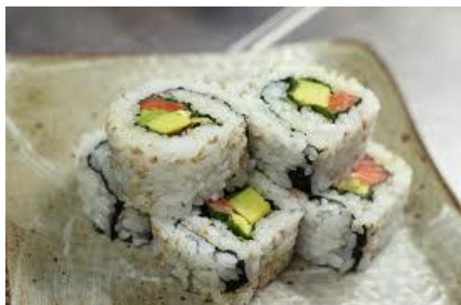
Fig. 12.5 A sample of Californian rolls.

I read about an article that bowls of rice, ' donburi ' and something which is a changed dish from California rolled sushi are taken by Australian people recently. Not only a bowl of beef cutlet and rice, ' gyu-done '; but bowls of curry, ' curry done '; pork cutlet, ' katsu done '; broiled chicken and rice, ' teriyaki-chicken done ' are said to be popular among them, since the prices are reasonable and the dishes are served fast and delicious. Recently a bowl of miso pork cutlet, ' miso-katsu done '; or smoke-sermon and rice, ' sermon done ', appeared in the food court in Brisbane.