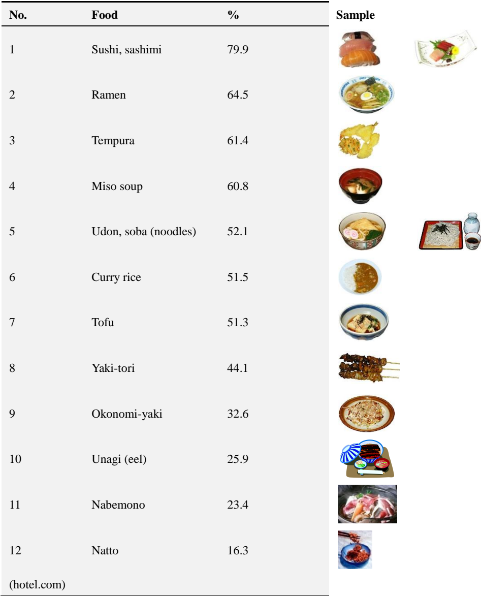
Table 12.1 Ranking of favorite Japanese foods in overseas.

A Japanese food loved by people from abroad includes okonomi-yaki , a kind of pancake with vegetables and meat (Table 12.1), and it will become a popular