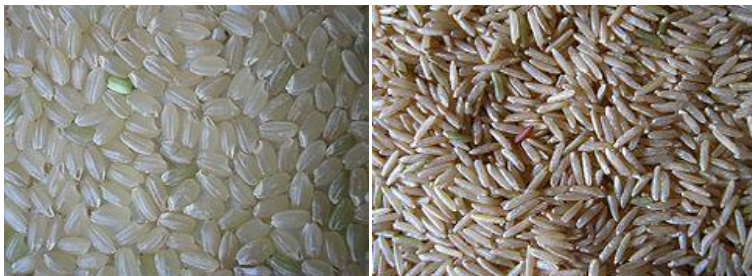
Fig. 12.1 Japonica rice grains (left) and Indica rice grains (right).

I like it very much". I found that those students liked a little chewy rice besides dry and crumbling rice.