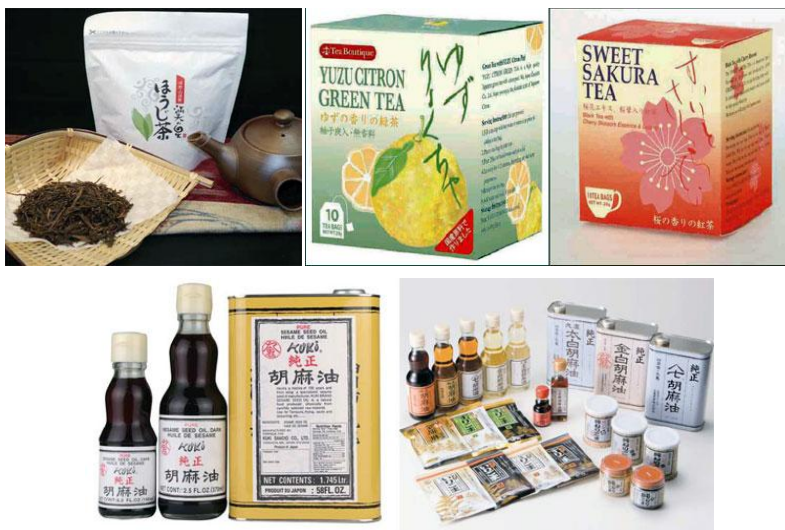
Fig. 12.4 Samples of exported teas and oils from Japan.

Upper left, roasted green tea; upper middle, yuzu (lemon) citron green tea; upper right, sweet sakura (cherry) tea; lower two photos, varieties of goma (sesame) oils.