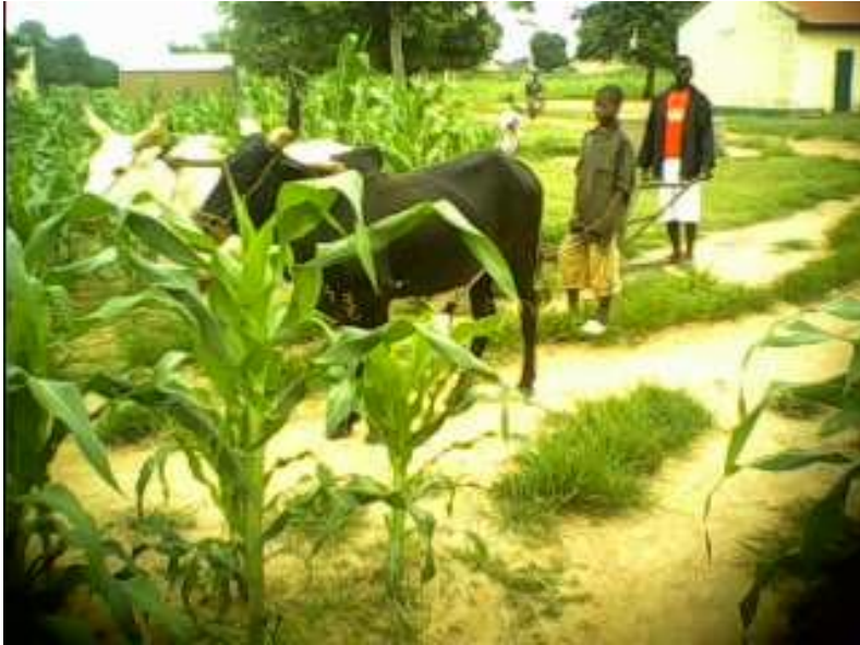
Figure 1. The Use of Oxen for Pre - and Post-Emergence Weeding of Farm Lands in North Eastern Nigeria.