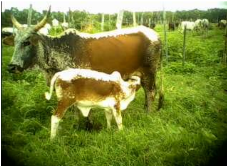
Figure 2. Natural Calf Rearing in Lala District, Gombi Local Government Area, Adamawa State, Nigeria.